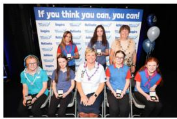
Epping Forest North