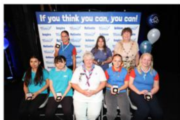
Epping Forest South